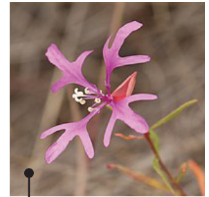
Elkhorn Wildflower Elkhorn Clarkia is a distinctive wildflower with 3-lobed petals. Lewis & Clark thought the petals looked like miniature elk antlers.

My goal for this installation would be to contribute to the local Meridian residents' existing local pride with a unique art installation that begins a theming element for the trails system.