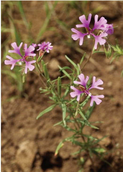
ELKHORN WILDFLOWER IMAGES